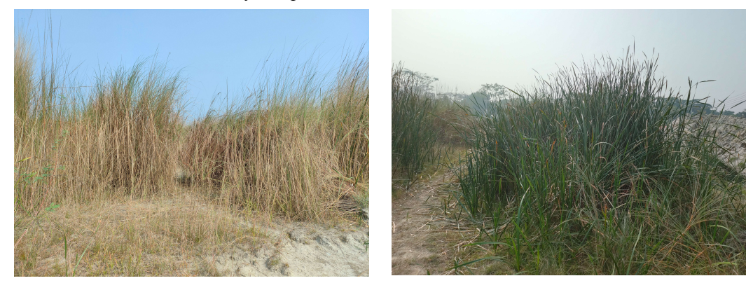
Figure 3: Catkin grass

Catkin is a kens grass plant. It scientific name is Saccharum spontaneum . It is usually up to 3 meters tall from the ground. It is seen in autumn (August-October) in Bangladesh. Catkin is usually grown in chars, wetlands, fallow lands and alluvial soil on the banks of rivers. The leaves of this flower are thin and the sides of the leaves are very sharp.