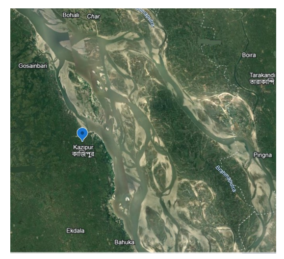
Figure 2: A pictorial view of charlands of river Jamuna at Kazipur

7<sup>th</sup> International Conference on Civil Engineering for Sustainable Development (ICCESD 2024), Bangladesh