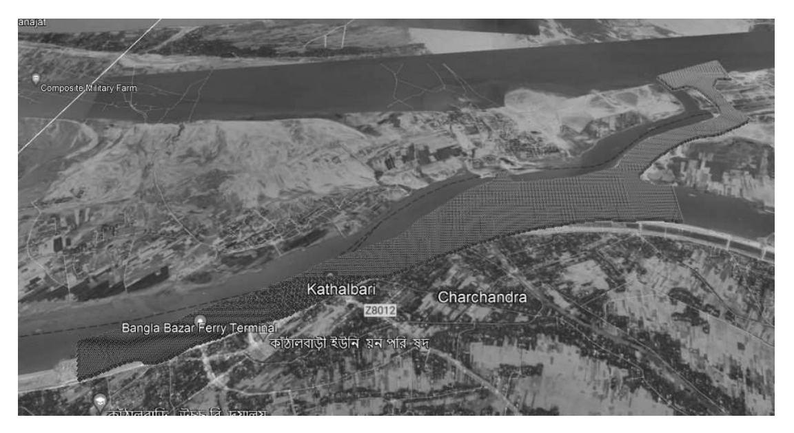
Figure 1: Plot of Mawa to Aricha route using Google Earth Pro

KML file was generated from Shp file and imported in Earth Pro and explained in Figure 1. Then it was cross checked for the actual navigational route whose volume is to be calculated. From that, the elevation of water level was found. A layer in ArcScene was created. In this layer, DEM data was the input data. The DEM data was needed for creating 3D model. These data were obtained from the website USGS. By creating an account. After downloading the Dem data, the input was given into ArcScene where a layer already has been created. Then using 3D analyst tool, the Dem data was converted. The layer coordinate system was set to BUTM. Then, we need to set some layer property like Rendering, Symbology, display (cubic convolution for continuous data), Base Height, Vertical Exaggeration etc. Then the 3D view of the model was prepared and explained in Figure 2.