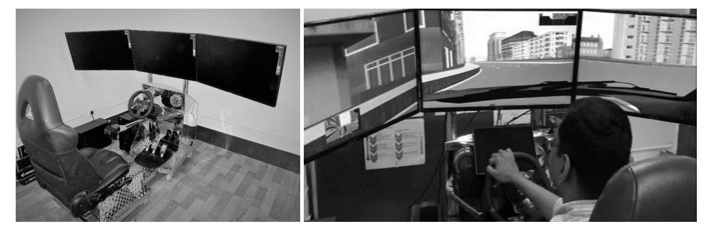
Figure 1: a) The driving simulator platform at BUET (left); b) The Experimental driving simulator with a predefined driving environment (right).

The simulation platform used in this driving simulator is the SCANeR<sup>TM</sup> studio software developed by A.V. Simulation. SCANeR<sup>TM</sup> studio is a comprehensive driving simulation software package used for vehicle ergonomics, advanced engineering studies, human factor studies, driver training, validate embedded road systems, and research related to road safety. SCANeR<sup>TM</sup> studio has an ergonomic interface used for either light or heavy vehicle simulation. This simulation software can be used to create road network terrains, build 3D vehicle models, develop traffic scenarios, simulate real-life driving environments, and analyze driving behavior based on various parameters with graphical representations.