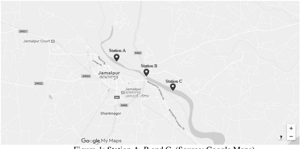
Figure-1: Station A, B and C.