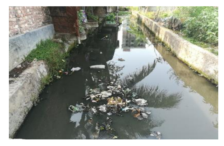
Figure 5: Existing Drainage Condition at Bastuhara Colony

5<sup>th</sup> International Conference on Civil Engineering for Sustainable Development (ICCESD 2020), Bangladesh