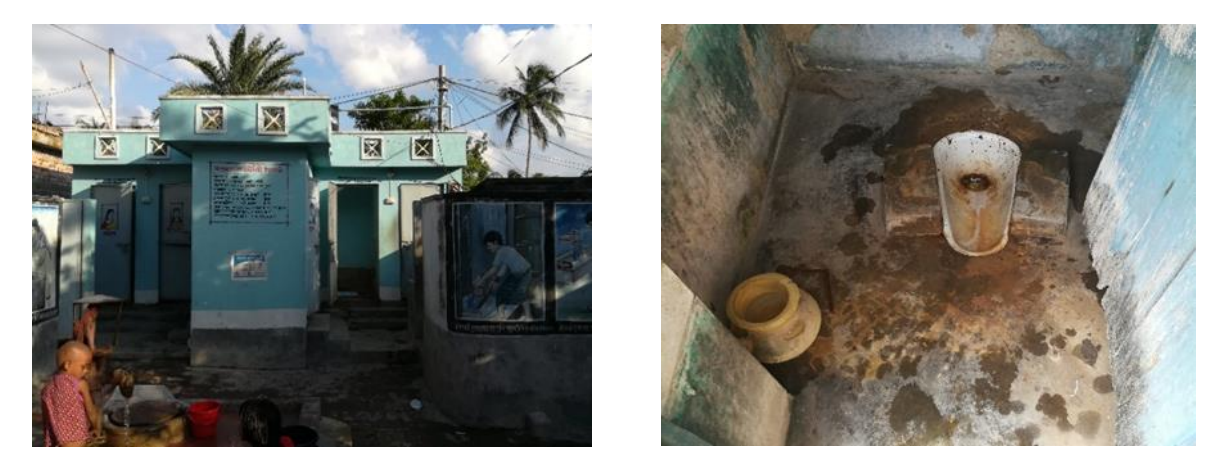
Figure 2: Bastuhara Community Toilet

In figure 2, Bastuhara Community's Toilet is shown which has some problems. The human excreta is disposed into the soakage pit but the size is very small, the low land area is overflowed at the rainy season. Fouling of latrines and urinals is common and once a latrine is fouled. Subsequent users find no other alternative but to foul it more. Thus operation and maintenance is a major problem in this system. In this slum, there is no full-time attendant for operation and maintenance.