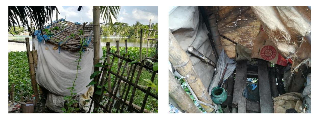
Figure 3: Over-hanging Latrines

The view of overhanging latrines is shown in Figure 3. These latrines stand by the side of the canal or river which is very unhygienic. Besides, canal water is used by many of the slum dwellers which is a cause for different water-borne diseases.