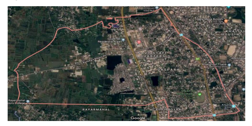
Figure 1: Satellite view of the study area

Bastuhara Colony of Khalishpur, Khulna was selected as the survey site. This study is undertaken to investigate the existing water supply and sanitation system in the study area. The map of the study area is shown in Figure 1.